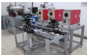
CHINO Corporation India Pvt. Ltd.