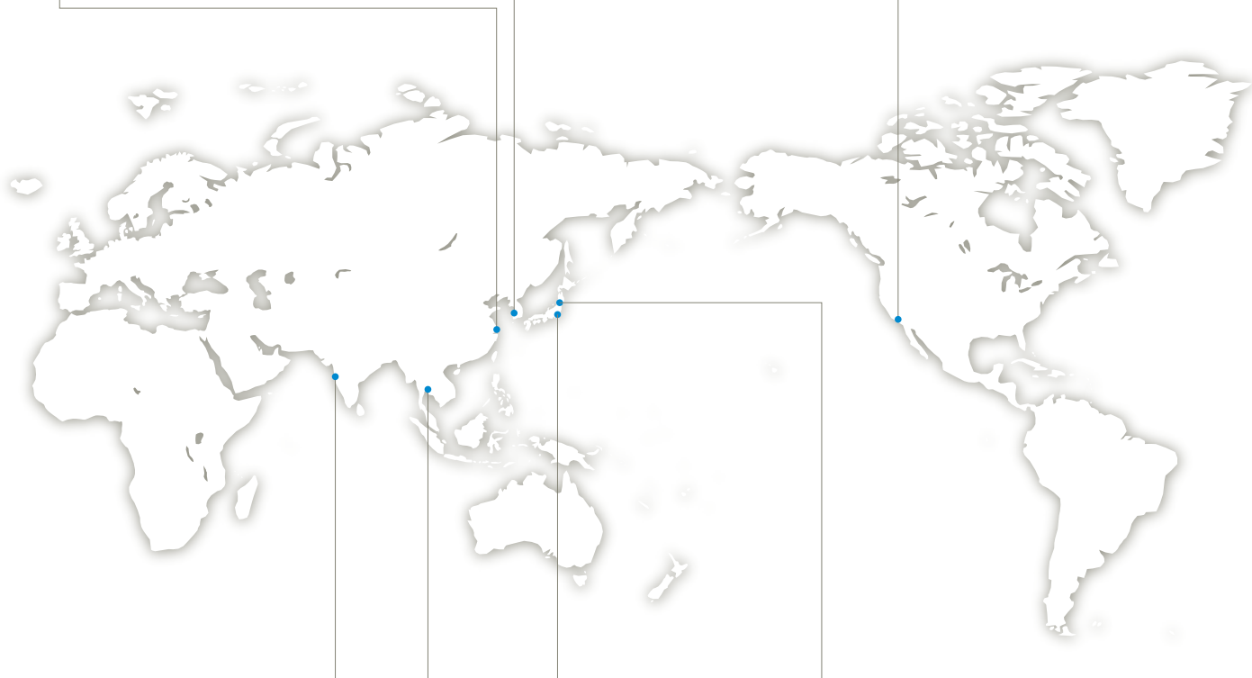
CHINO Corporation India Pvt. Ltd.