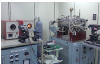
Korea CHINO Corporation